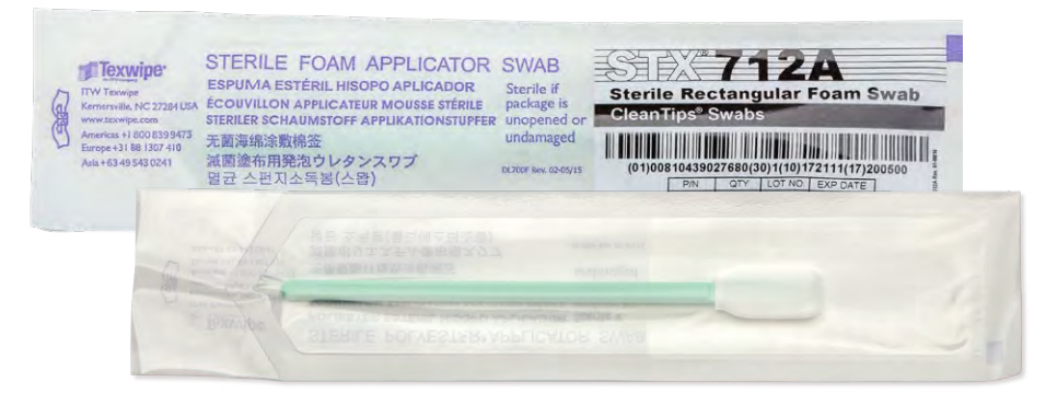
Sterile swabs are individually packaged in a peel-apart sleeve

Compatible with variety of solvents and disinfectants (see the chart on page 17).