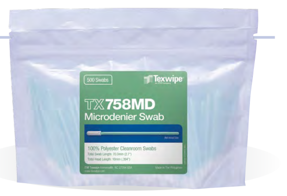
Packaged in a reclosable, silicone-free bag with a wide base which allows the bag to stand vertically.

Cleanroom manufactured, made to exacting and consistent tolerances using highprecision automated processes. Lot coded for traceability and quality control.