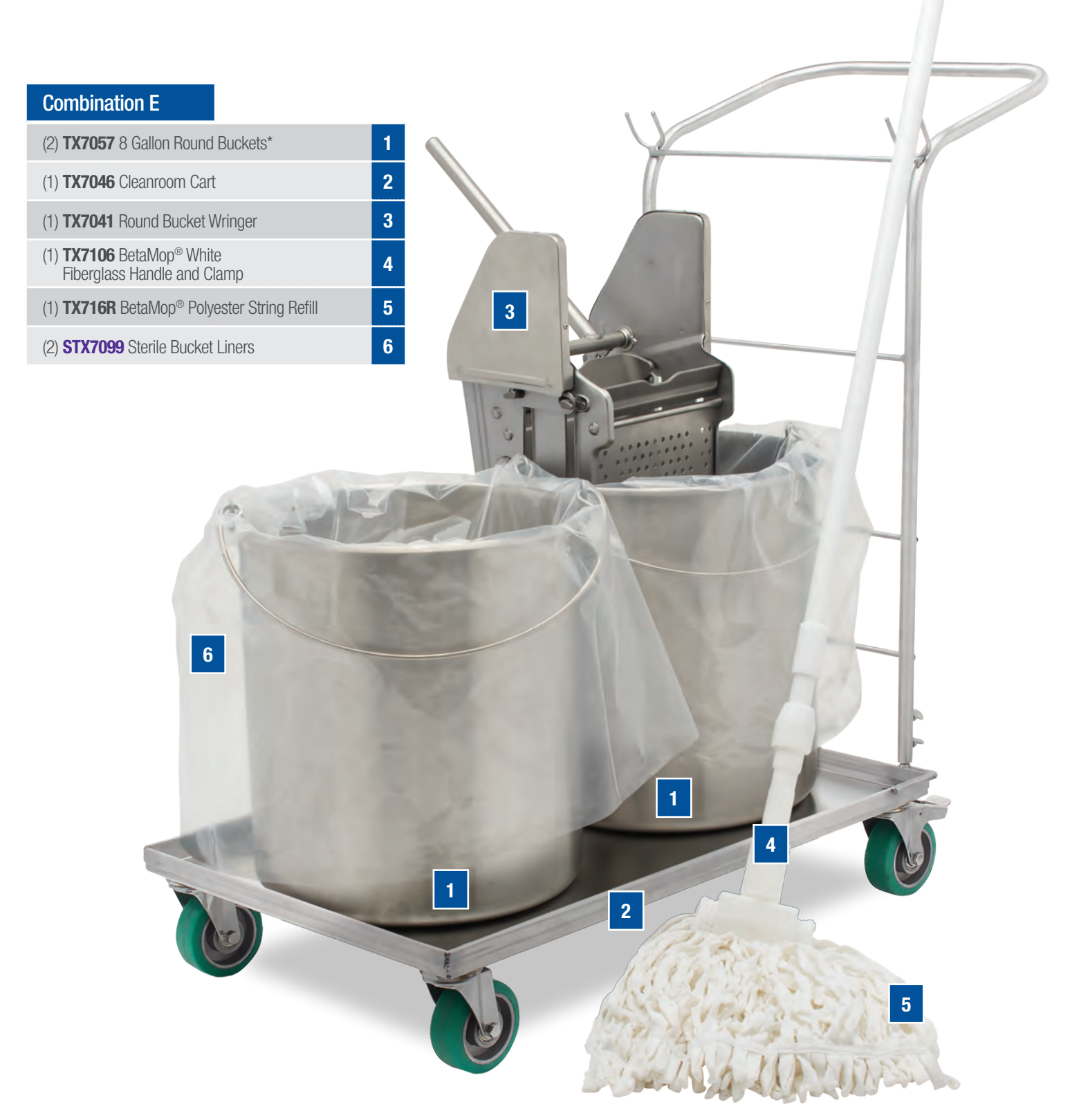
*Also available in 10 gallon size, TX7058