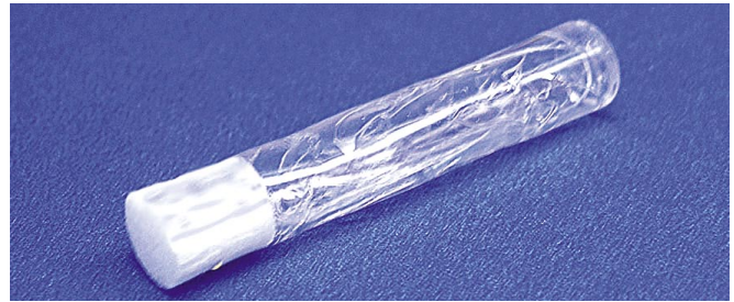
Figure 2. Emitter tips should be cleaned at regular intervals to maintain optimum system performance. One convenient method is to use a pre-wetted swab (shown here), which is shipped with a protective sleeve covering the white foam swab end. The swab incorporates an inner glass vial of alcohol inside a plastic tube.

The problem escalates when the power supply is running at its