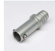
TX10217 TexConnect ™ Adapter For use with TX7183 to attach screw-based mop heads.